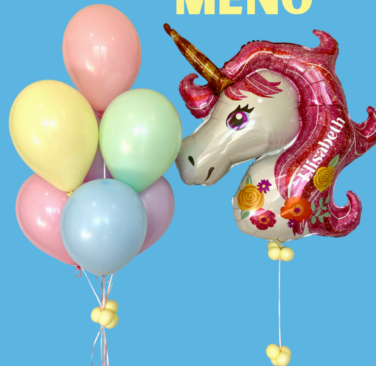
Option 2 – $53