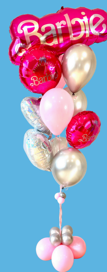
Option 3 – $60