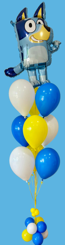
Option 4 – $60