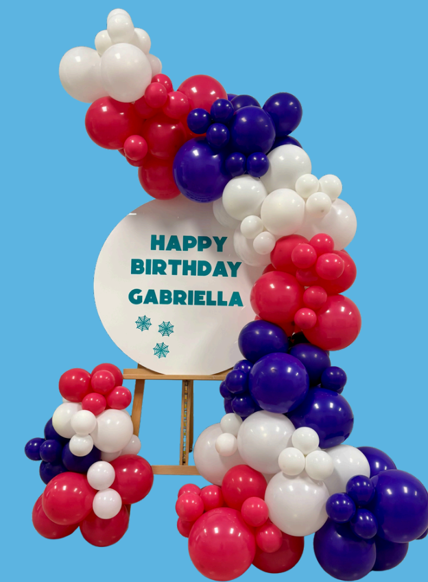
Option 12 – $175

Double Arch Wall Includes Garlands & message