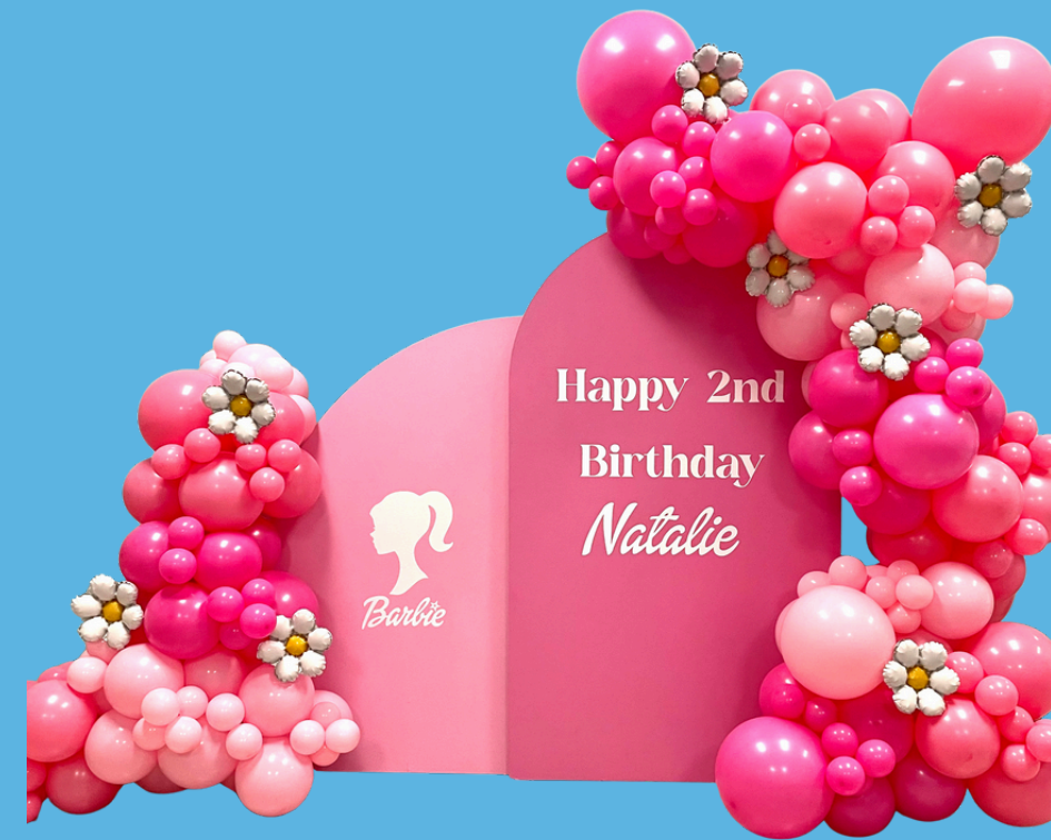
Option 11 – $525

Flat Arch Wall & Plinth Includes Garland & message