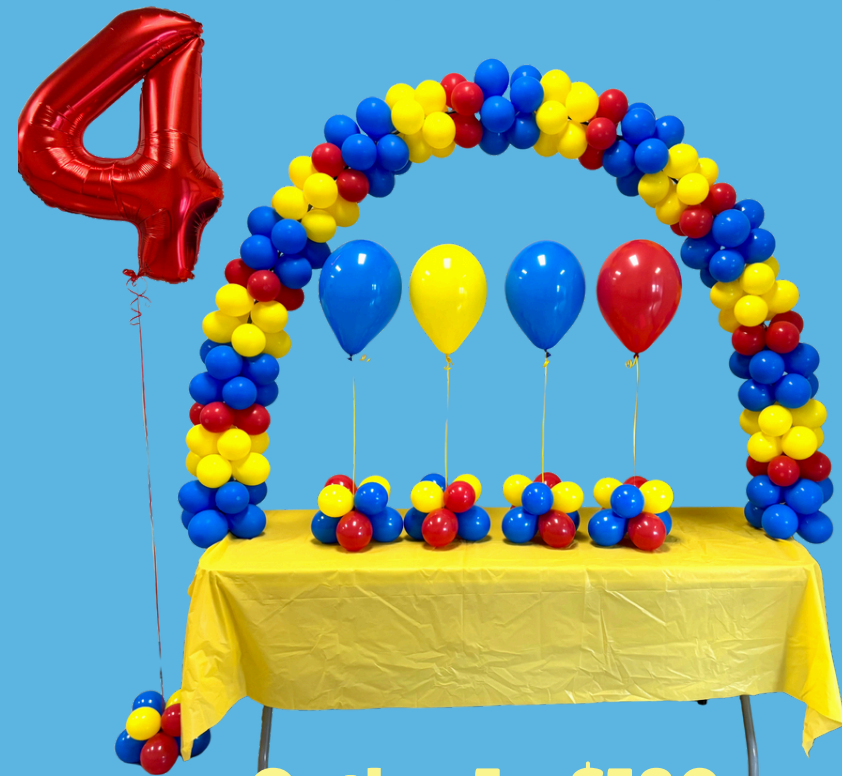
Option 1 – $180

Tabletop Arch, 4 centre-pieces Helium Number