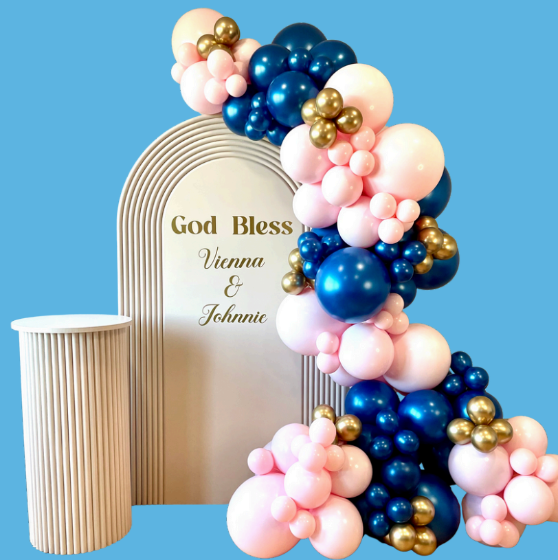
Option 9 – $425

White Flat Ripple Wall & Plinth Includes Garland & message