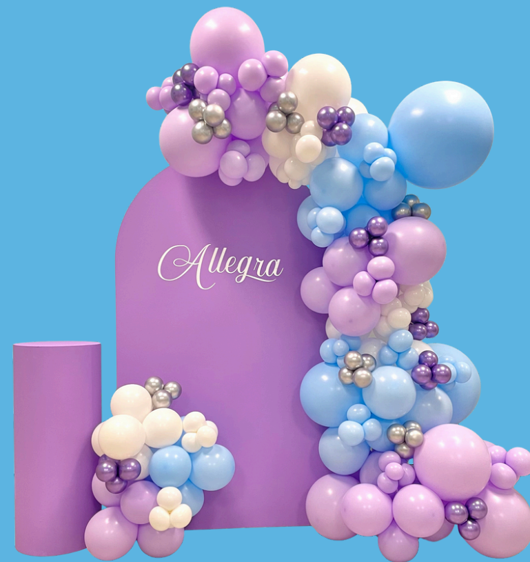
Option 10– $425

White Flat Ripple Wall & Plinth Includes Garland & message