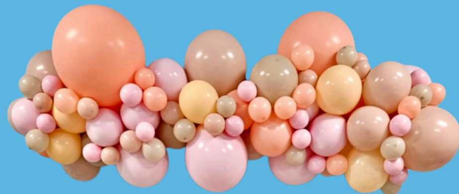
Option 5– $175

Tabletop Arch, 4 centre-pieces Helium Number