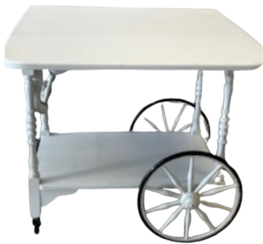
Dessert Trolley Rental $45* (28" high)