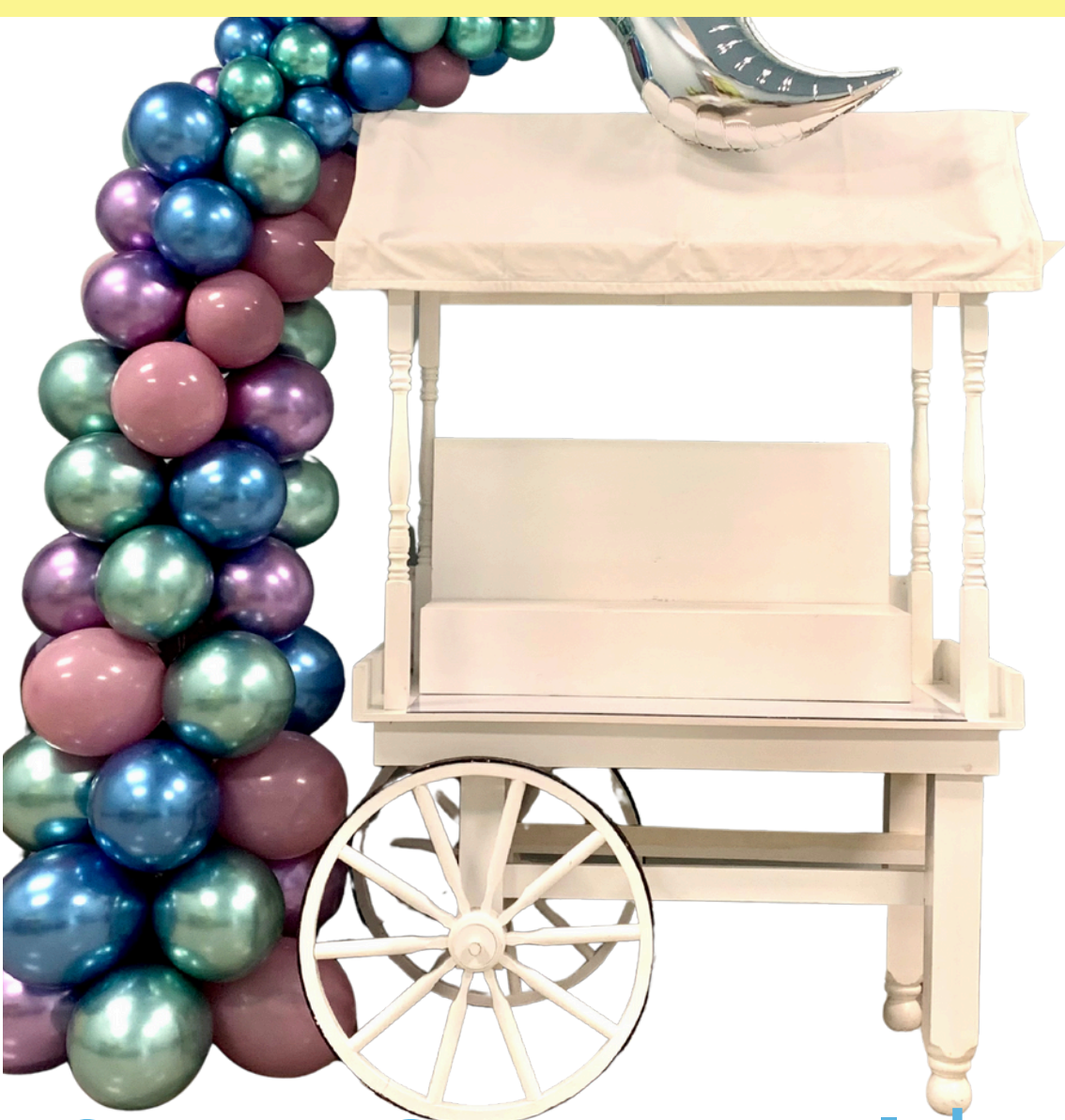
Sweet Cart Rental $75* (balloons not included)